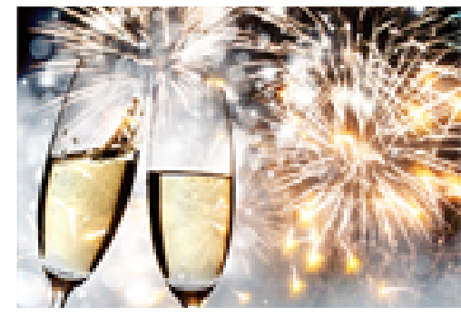
Happy New Year! Out with the old and in with the new as we come in to the new year! We wish you and your family all the best for 2018!