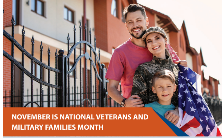
NOVEMBER IS NATIONAL VETERANS AND MILITARY FAMILIES MONTH

On Monday, November 14th, we will be hiding six turkey decorations throughout the community. Find one and bring it into our Leasing Office by November 18th for a prize!