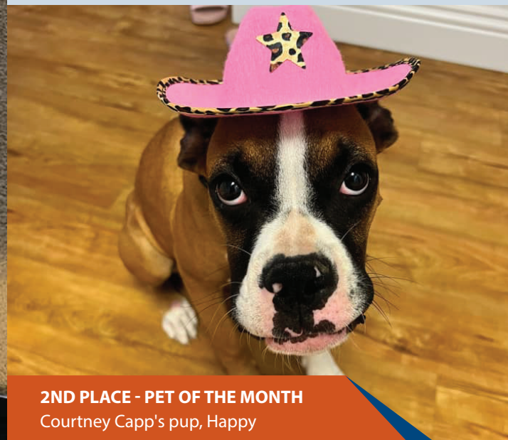
2ND PLACE - PET OF THE MONTH