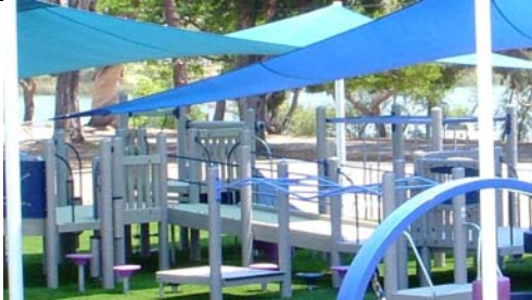
LAKE O'NEIL EFMP PLAYGROUND

Description: The San Diego County Fair is the sixth largest fair in the nation and is the largest annual event in San Diego County. This year the Fairgrounds will transform into "Music Mania", San Diego's biggest music festival, with 22 days and 8 stages.