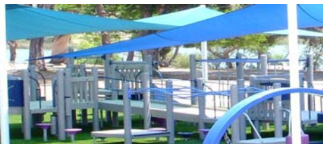
LAKE O'NEIL EFMP PLAYGROUND

Decorated Dinghy Parade: Participants can decorate their small boats in patriotic themes and cruise Oceanside Harbor starting at 2 p.m. July 4. As they pass the Oceanside Yacht Club, they will be judged. The event is sponsored by the club. Information: (760) 722-5751.